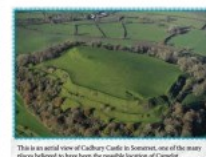
This is an aerial view of Caerboron Castle in Somerset, one of the many places believed to have been the possible location of Camelot.