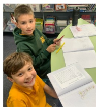
Identifying vowel and consonant sounds