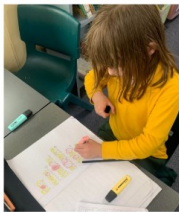
Practising identifying digraphs